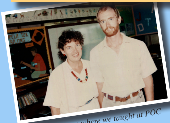
our classroom where we taught at POC

I know this is a huge request - and that it might not be feasible at all. But please do let me know if you think you might be able to help out and what other questions you would have."